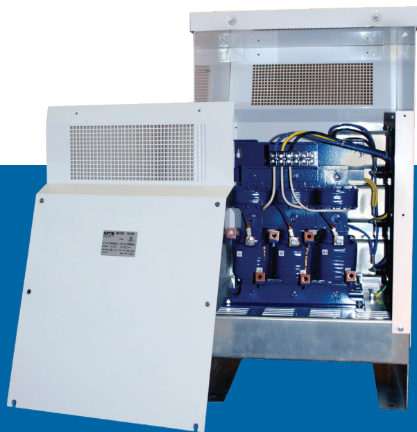
Matrix AP: NEMA 1 Shown Above